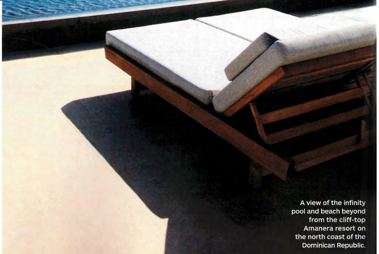
A view of the infinity pool and beach beyond from the cliff-top Amanera resort on the north coast of the Dominican Republic.