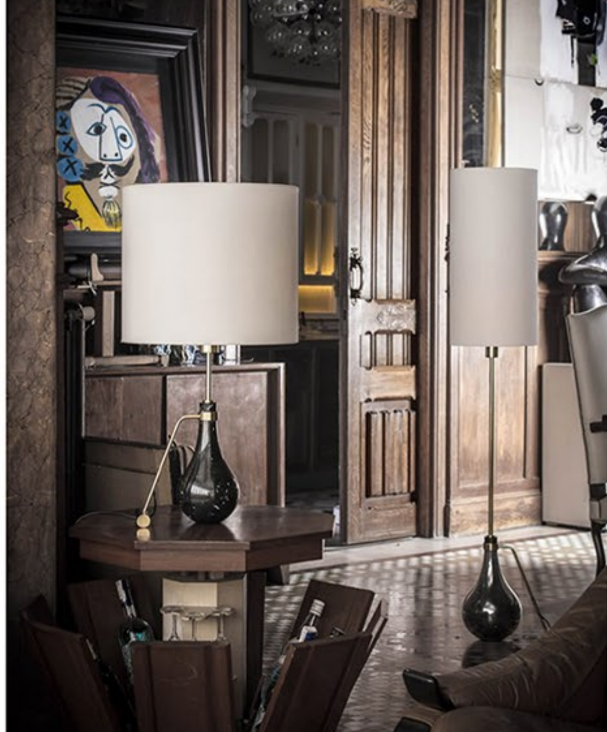
Eva © Eugeni Aguiló