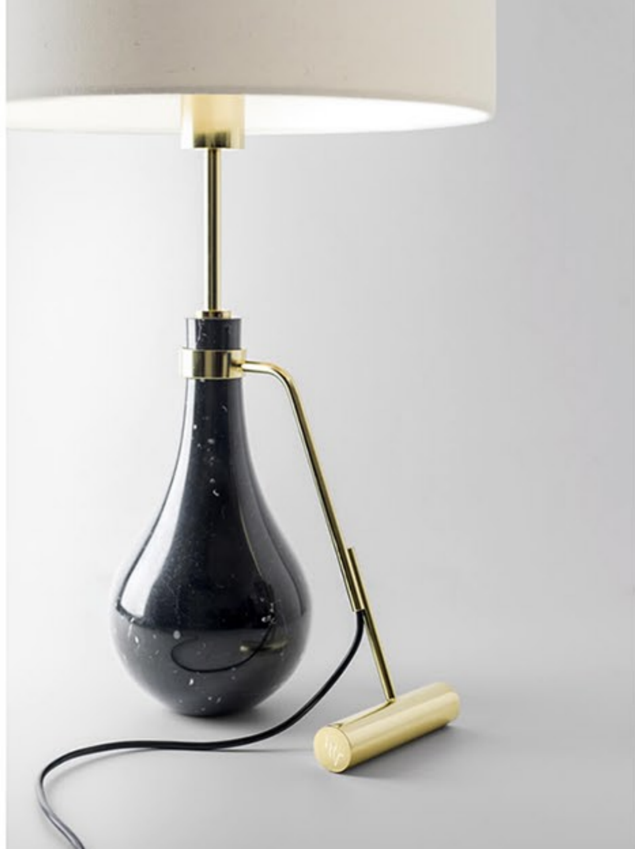
Eva © Eugeni Aguiló