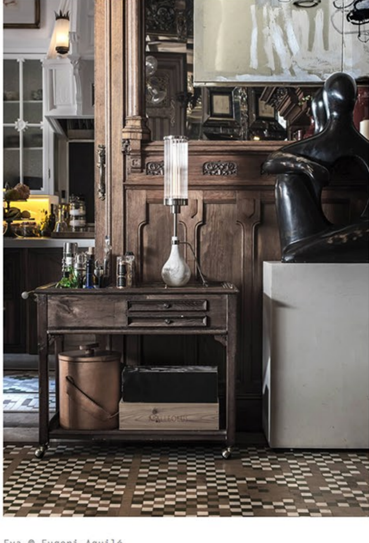
Eva © Eugeni Aguiló