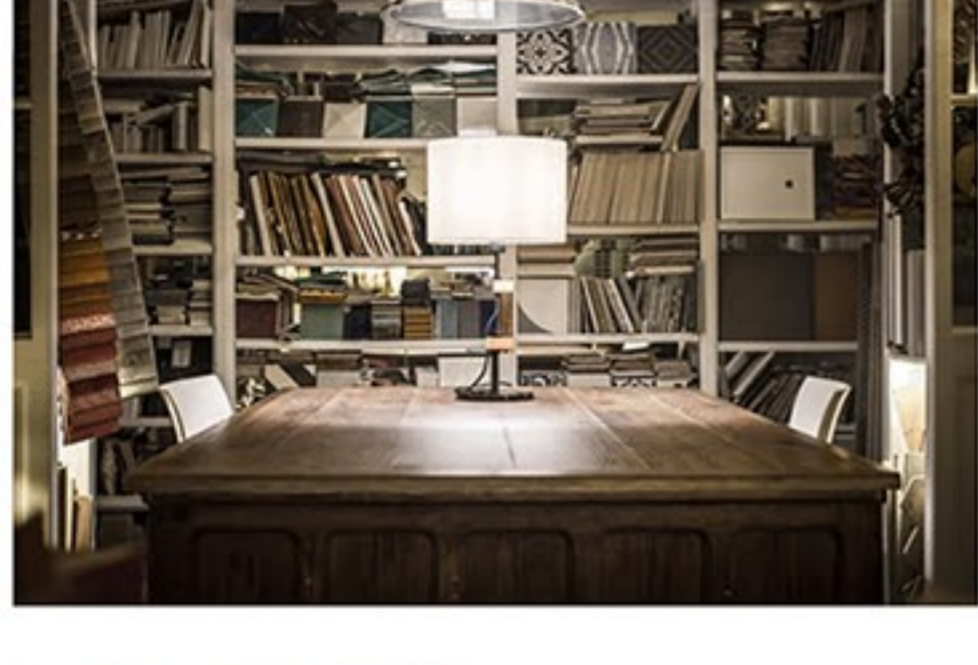
Frank